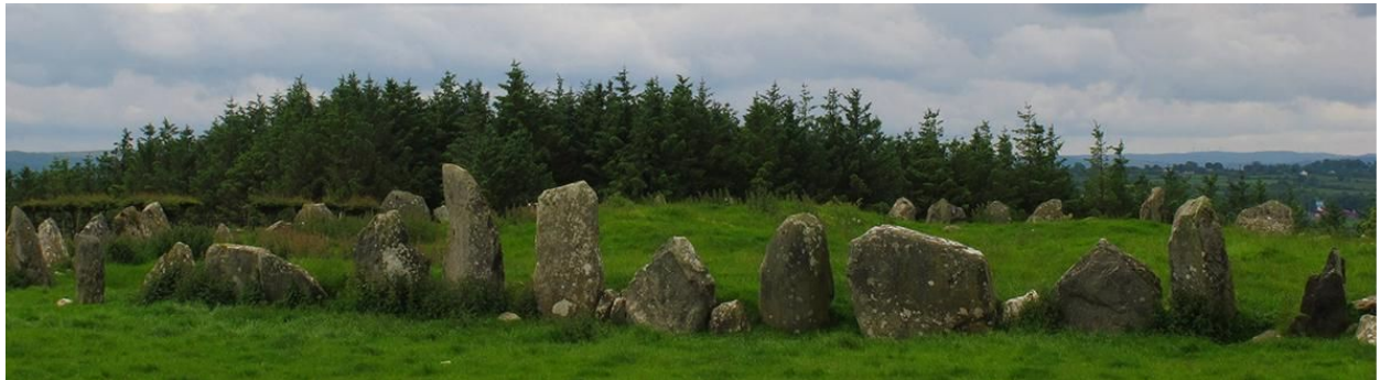
Beltane Stone Circle, County Donegal