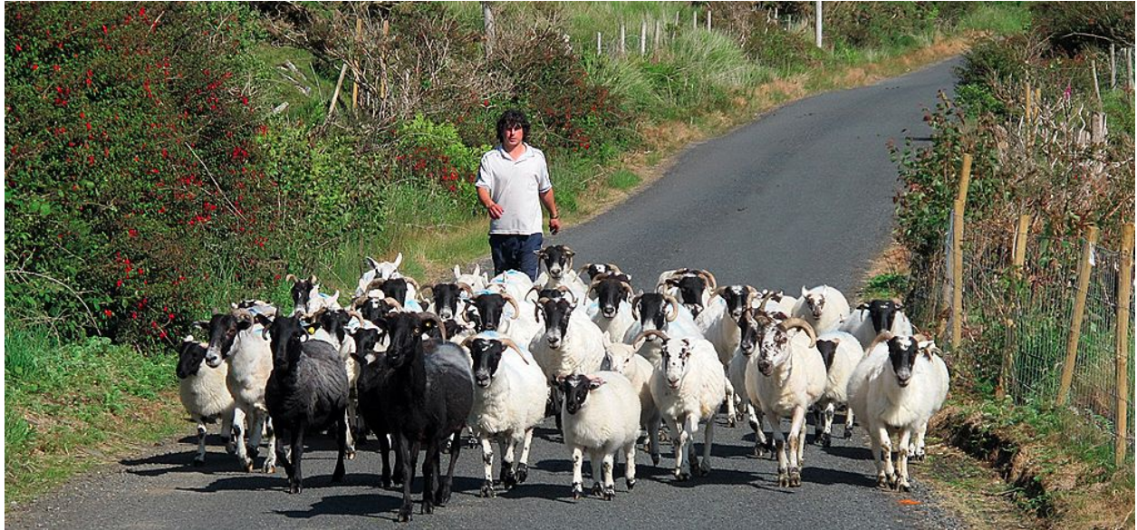
Sheep Traffic Jam, Glencolmcill, County Donegal, Ireland