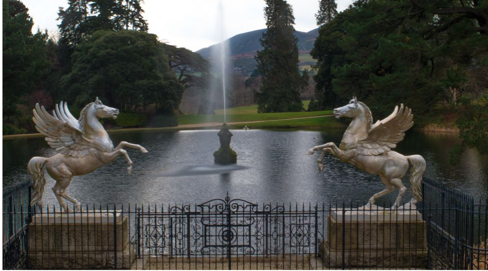
Gardens at Powerscourt Estate, County Wicklow