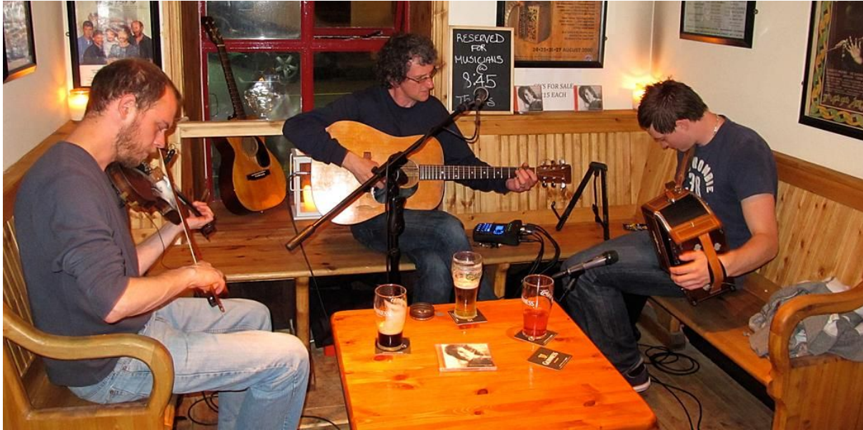
Traditional Irish music played nightly in the best pubs in Donegal, Antrim and Wicklow

Group travel with professional tour guides offers many opportunities that you will not experience any other way, including an exposure to local history, culture, music and unique friendships. It's also nice to let someone else do the driving (particularly on narrow roads where they drive on the other side of the road.) Travel can be stressful; group travel takes the stress out of foreign travel and allows you to focus on why you are there... to enjoy the entire cultural experience. And... we have one primary rule on our group trips: No Ugly Americans (no whining!)