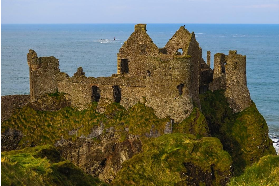
Dunluce Castle, County Antrim, Northern Ireland