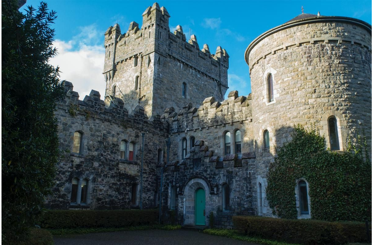
Glenveagh Castle and National Park, County Donegal

We recommend United, Delta Airlines or Air Lingus for the best schedules and direct flights from east coast US cities to Shannon International Airport. (PLEASE... check with us before confirming your flights.