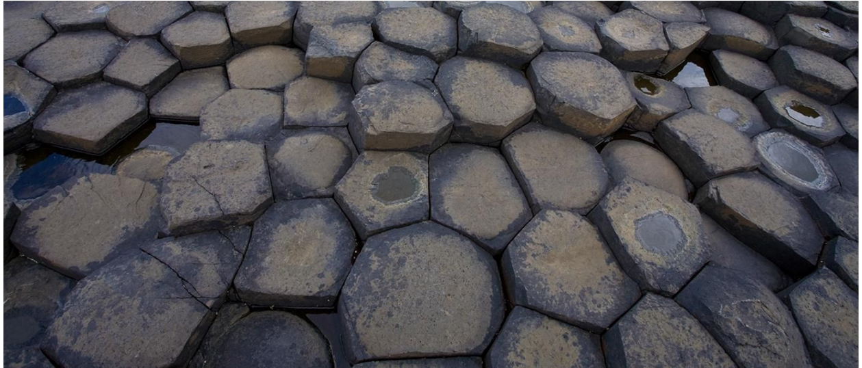
Giant's Causeway, County Antrim, Northern Ireland