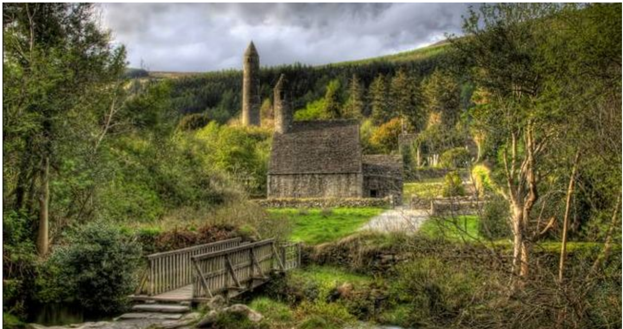
Twin Round Towers of Glendalough Monastery, County Wicklow

Cancellation Policy: Prepaid fees (deposits) are refundable minus a processing fee up until April 2 nd , 2017 at which point we are unable to provide refunds.