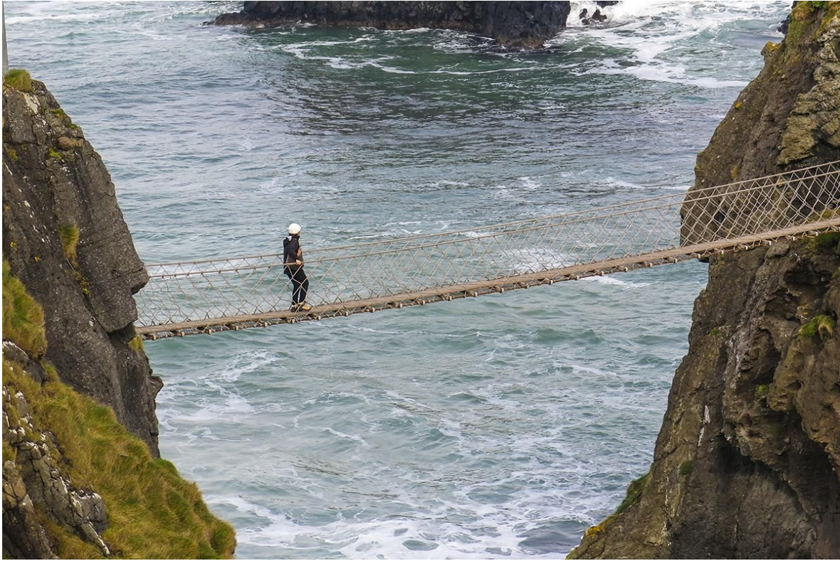
Carrick-a-Rede Rope Bridge, County Antrim, Northern Ireland