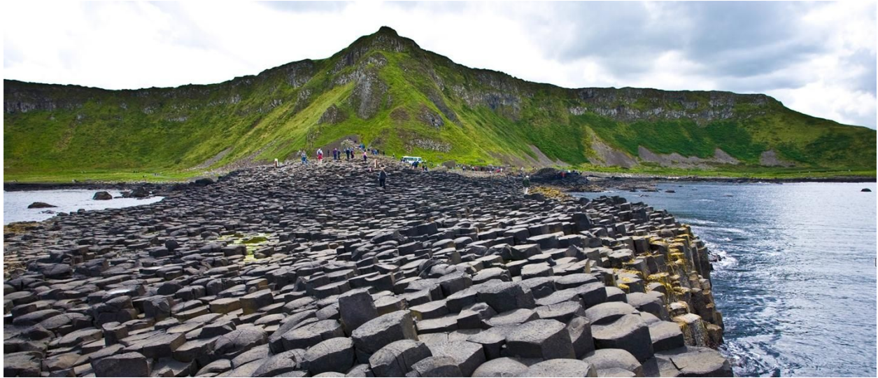
Giant's Causeway, County Antrim, Northern Ireland