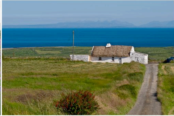
Some pretty sights (Killarney, County Kerry) and an iconic thatched roof cottage (County Clare)