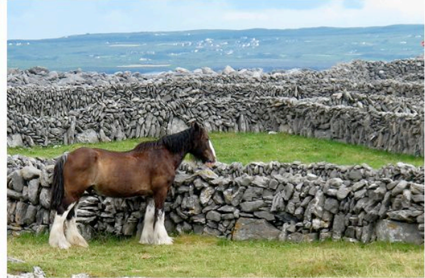
Friendly dolphin and work horse Aran Island Inis Oirr (County Galway)