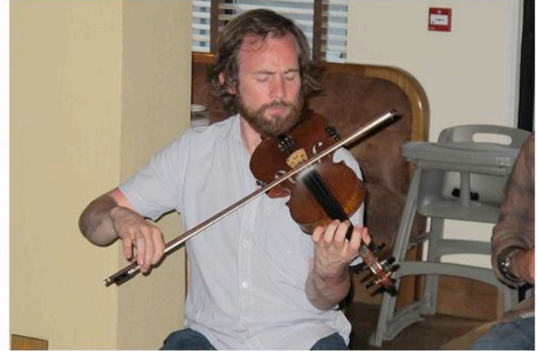
A private House concert (Gregans Castle) and Fiddle music in Shannon, County Clare)