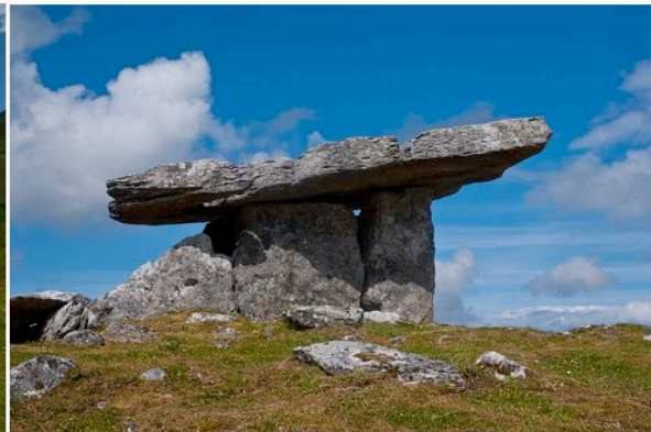
The standing stone at Sleah Head, Dingle (left) and the Poul nabrone Dolmen County Clare (right)