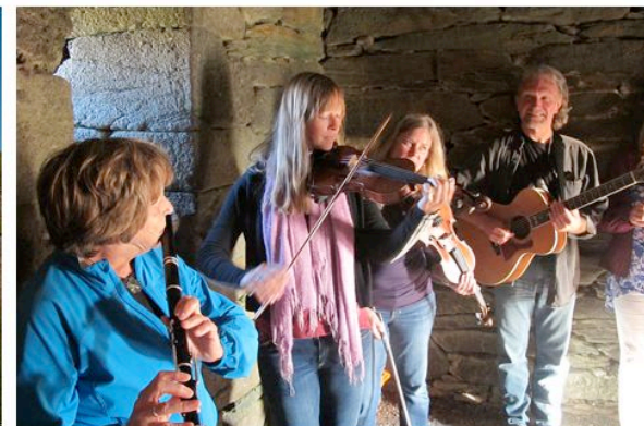
Summer solstice ceremony at the Gallarous Oratory, Dingle Peninsula, County Kerry