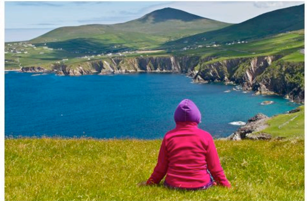
Healing Ceremony at Uragh Stone Circle and meditation time at Sleah Head, Dingle Peninsula