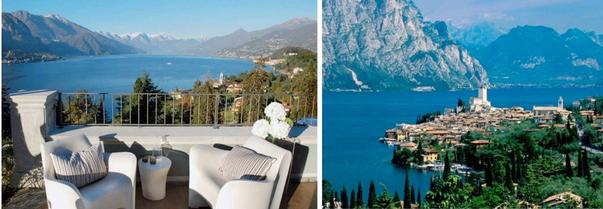
Stunning views of the lake region of Italy

Tuscany is nice (so is Venice and Cinque Terra), but for decades I have wanted to see the Lake Region of Italy and become mesmerized by the snow-capped mountains that surround the alpine resorts of Como and Bellagio. Next year's Spirit of Italy tour will travel to Lake Como as plans are underway to return to Italy for the Eat, Walk Meditate Workshop retreat now scheduled for late September 2015. Details soon. But in the mean time, if interested please let me know and mark your calendars for the last 10 days of September, 2015