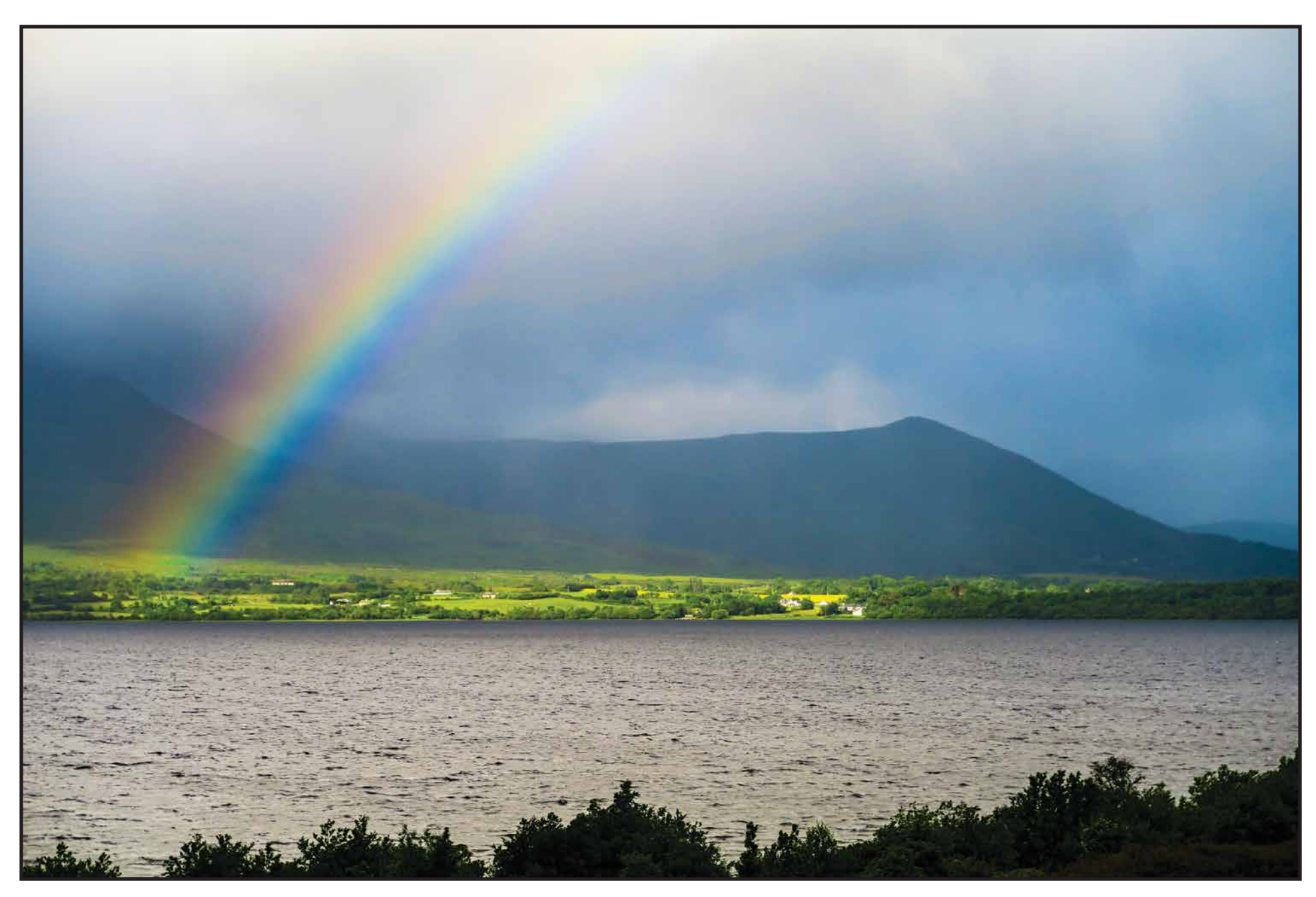
Rainbow over Killarney Lakes, Killarney, County Kerry