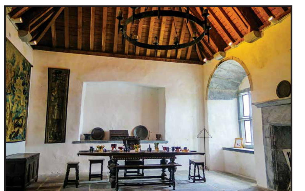
Dining room of the Ross Castle, Killarney, County Kerry