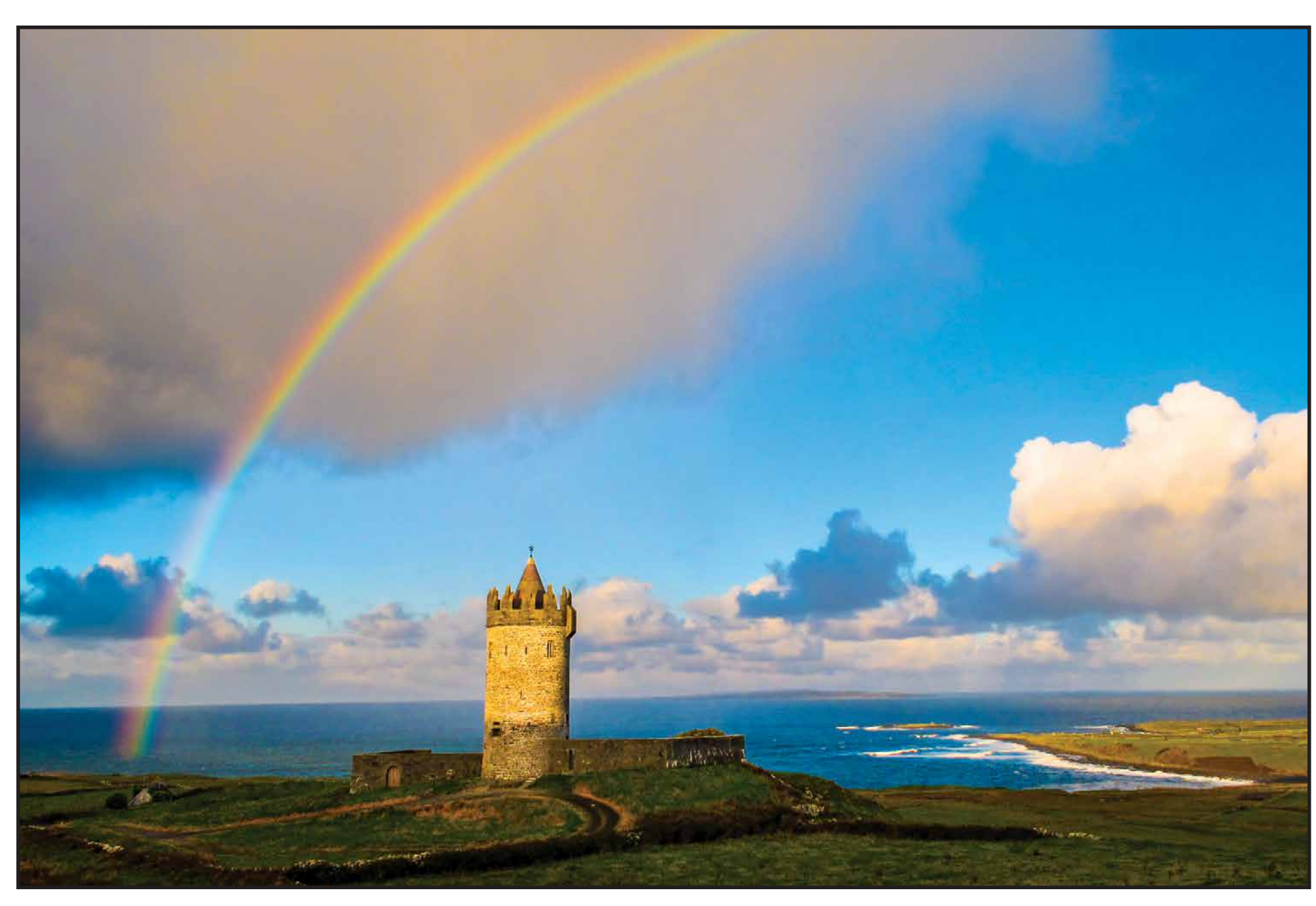
Rainbow over Doonagore Tower, Doolin, County Clare