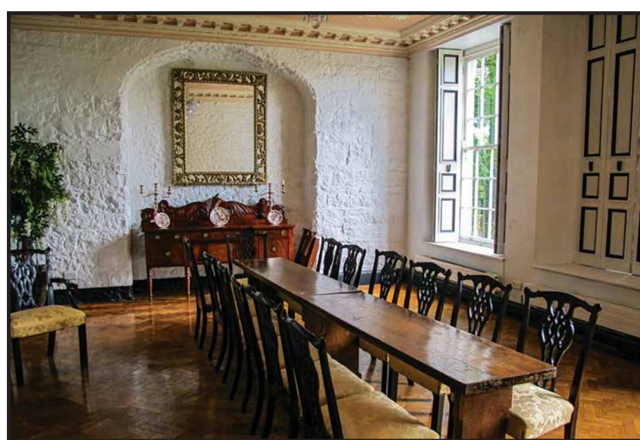
Dining room of the Knappogue Castle, Ennis, County Clare