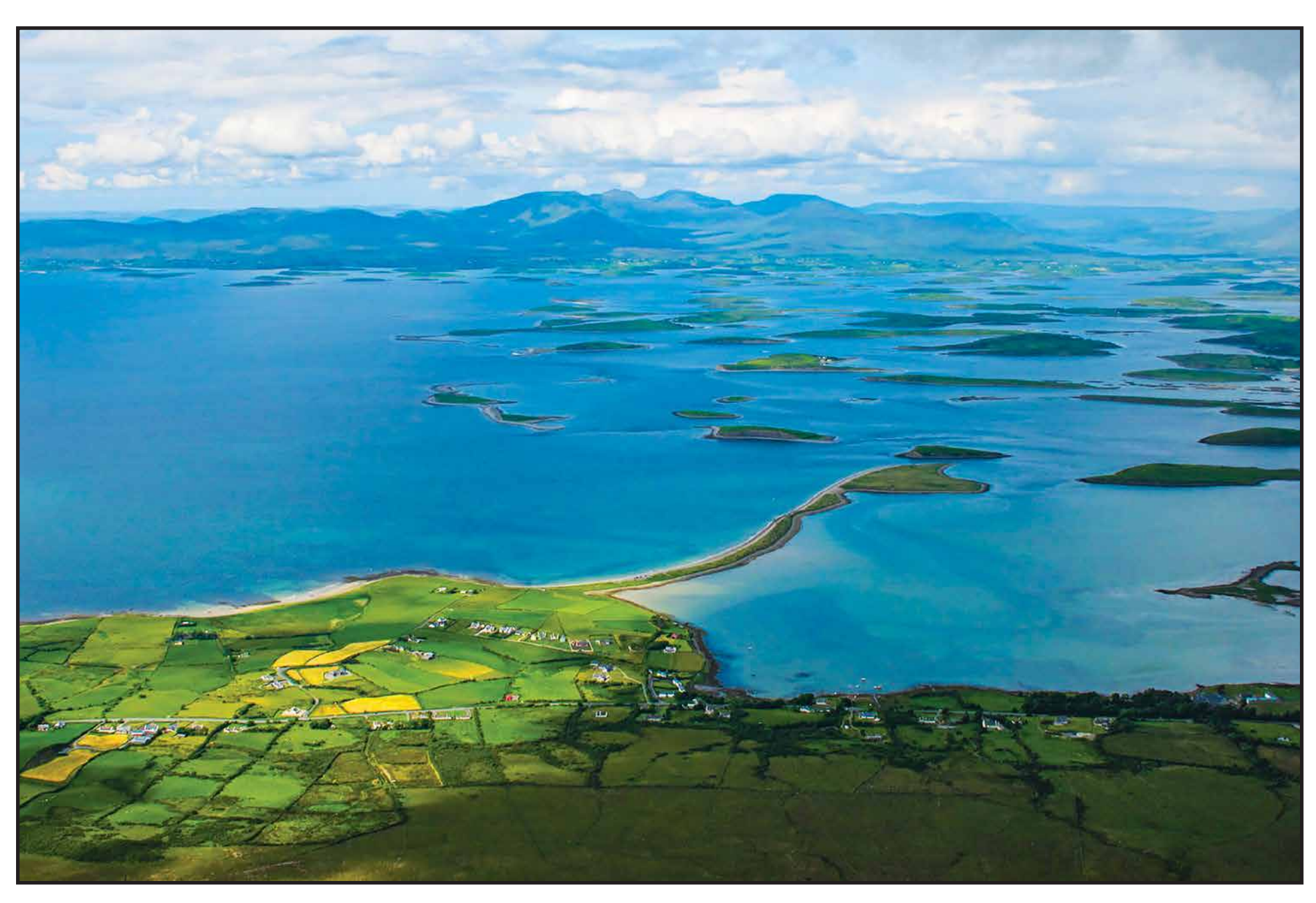
View of Westport, County Mayo from the top of Croagh Patrick