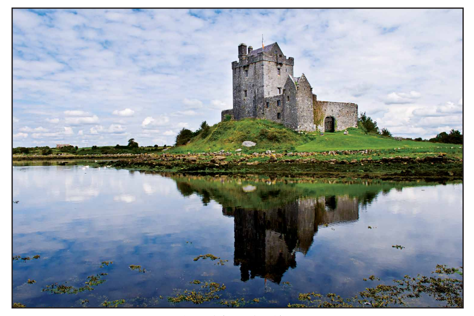
Dunguaire Castle, Kinvara, County Galway