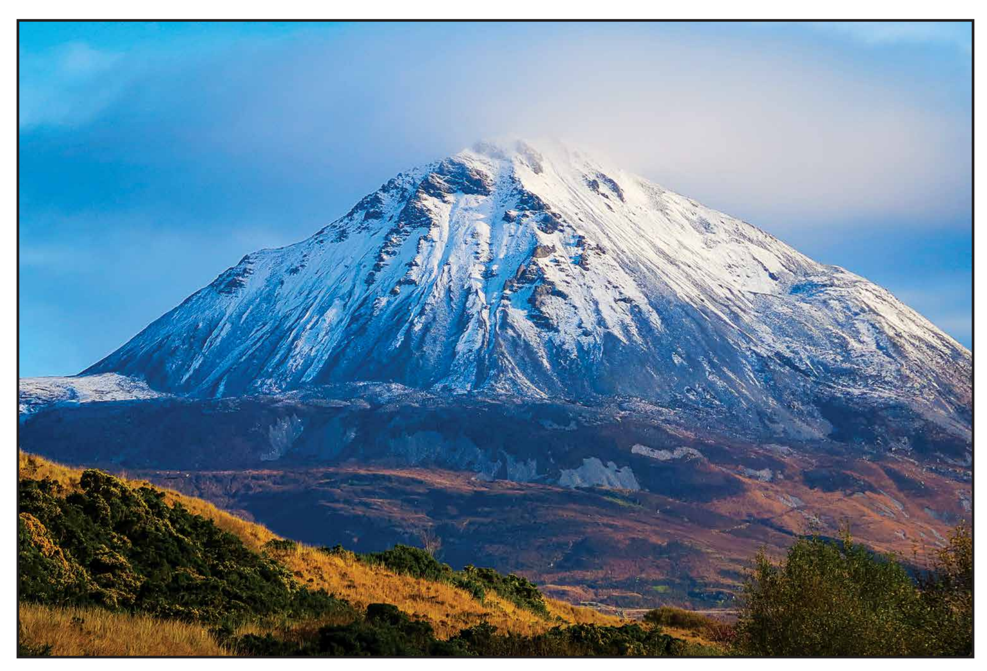
Mount Errigal covered in snow, Gweedore, County Donegal