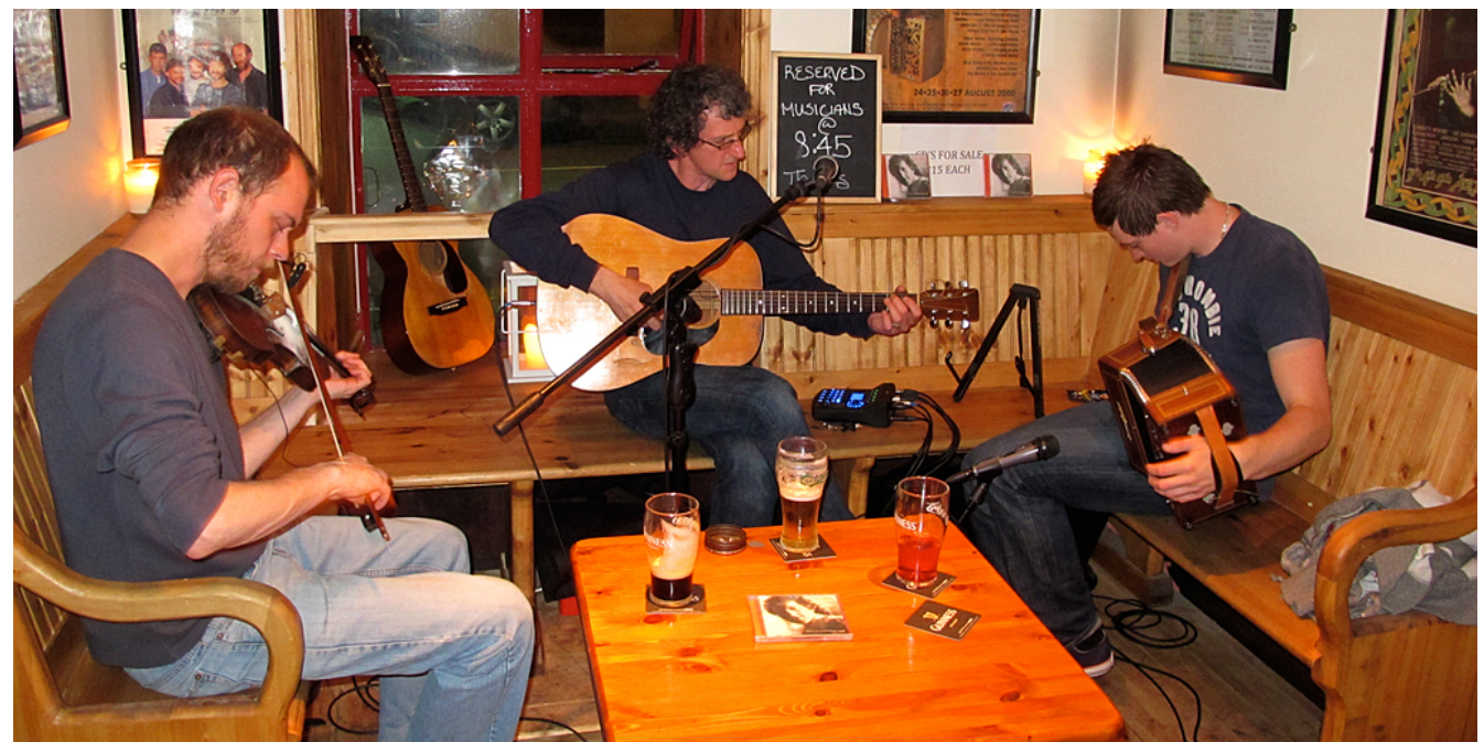
Traditional Irish music played nightly in the best pubs in Donegal, Antrim and Wicklow

Group travel with professional tour guides offers many opportunities that you will not experience any other way, including an exposure to local history, culture, music and unique friendships. It's also nice to let someone else do the driving (particularly on narrow roads where they drive on the other side of the road.) Travel can be stressful; group travel takes the stress out of foreign travel and allows you to focus on why you are there... to enjoy the entire cultural experience. And... we have one primary rule on our group trips: No Ugly Americans (no whining!)