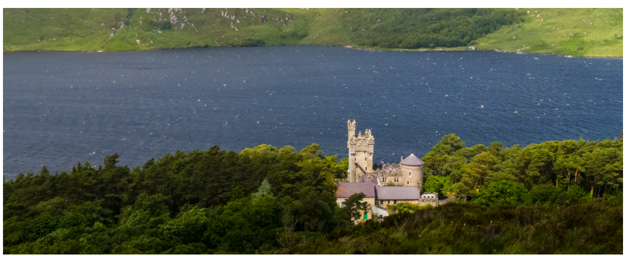
Glenveigh Castle, Glenveigh National Park, County Donegal, Ireland