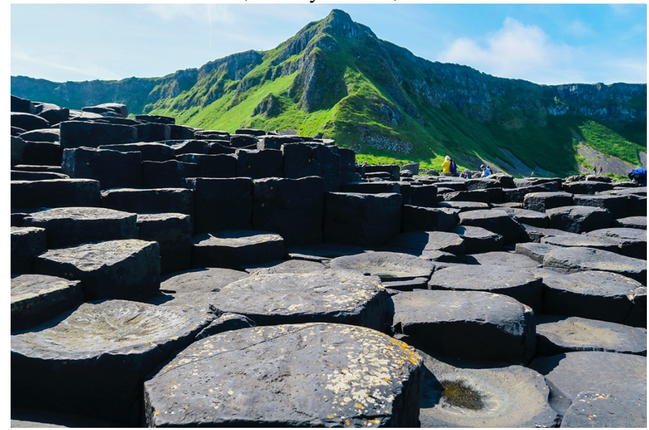
Giant's Causeway, County Antrim, Northern Ireland Spirit of Ireland Tour Comments

Dunluce Castle, County Antrim, Northern Ireland