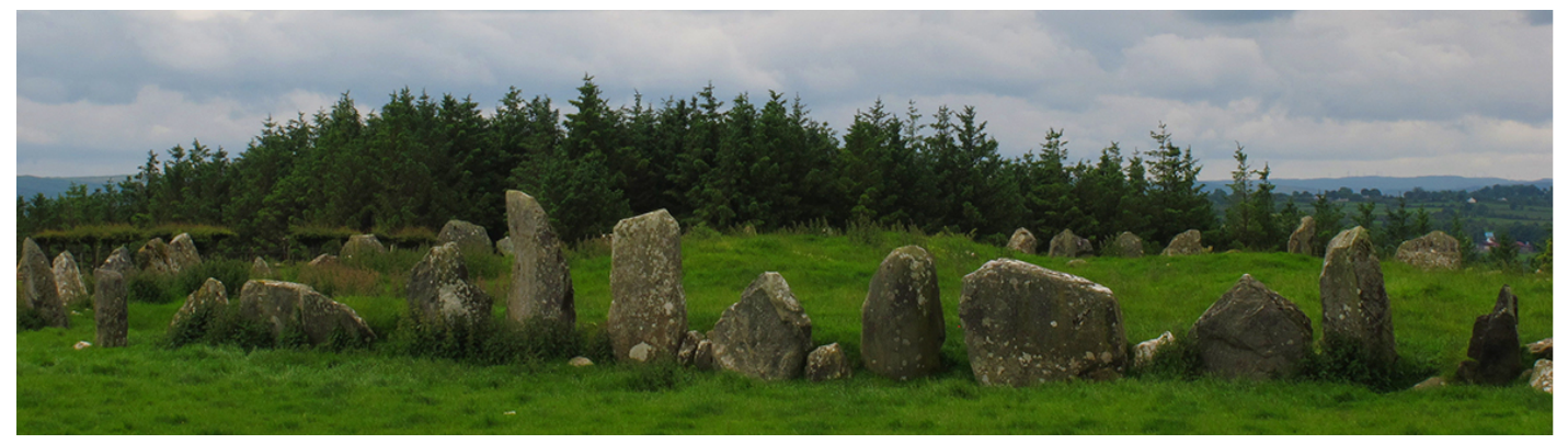
Beltane Stone Circle, County Donega